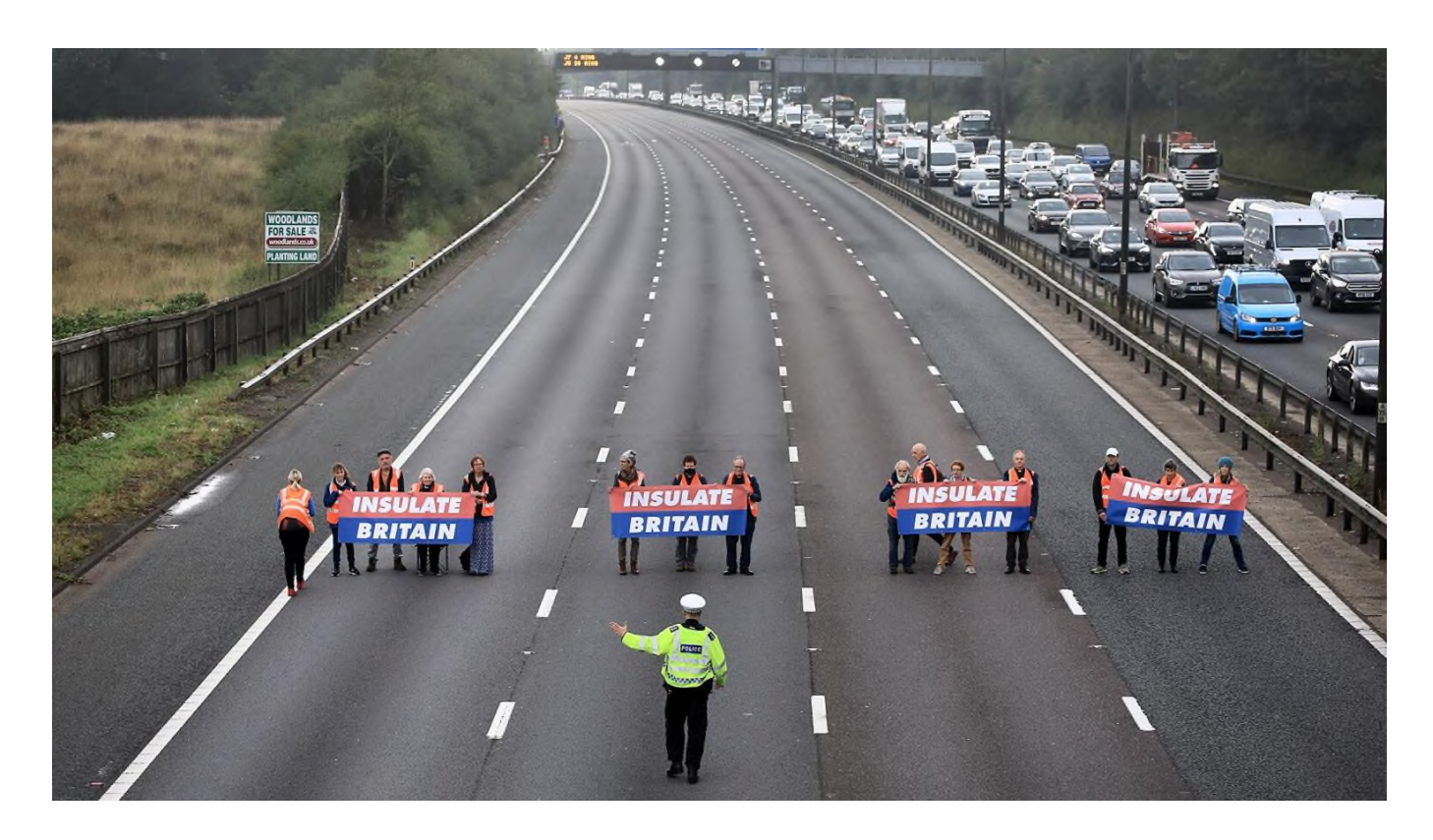
M25 Motorway, London | September 2021

Sign up for News, Updates and Events via the Action Network here